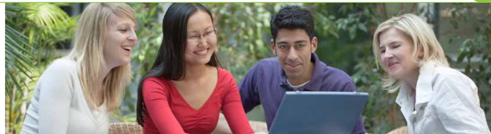
Promote, manage, monitor and review Professional Development across the workforce